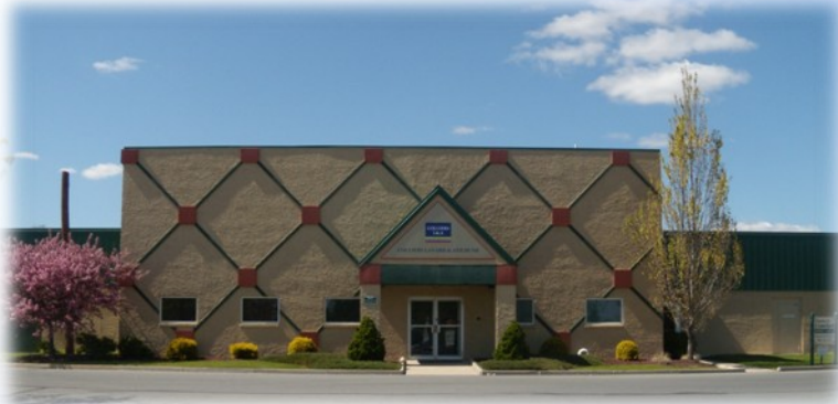
Green Hills Commerce Center